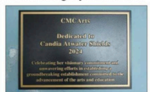
A plaque dedicating the museum building to Candia Atwater-Shields adorns the wall outside of CMCArTS on Thursday afternoon in Frederiksted, St. Croix.

and to inspire others... I know we're a nonprofit, but it takes a lot to start something from scratch — particu-