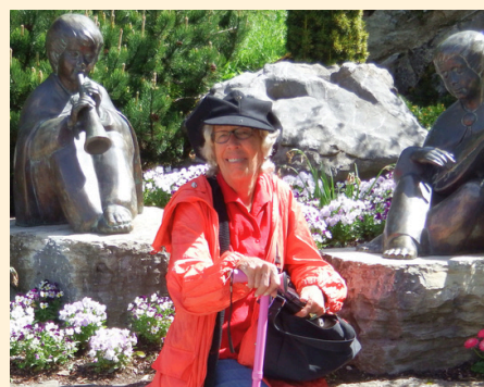
Photo was taken in Gstaad, Switzerland in 2017, a six week holiday across Europe.