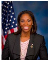
STACEY E. PLASKETT VIRGIN ISLANDS

2059 RAYBURN BUILDING WASHINGTON, DC 20515